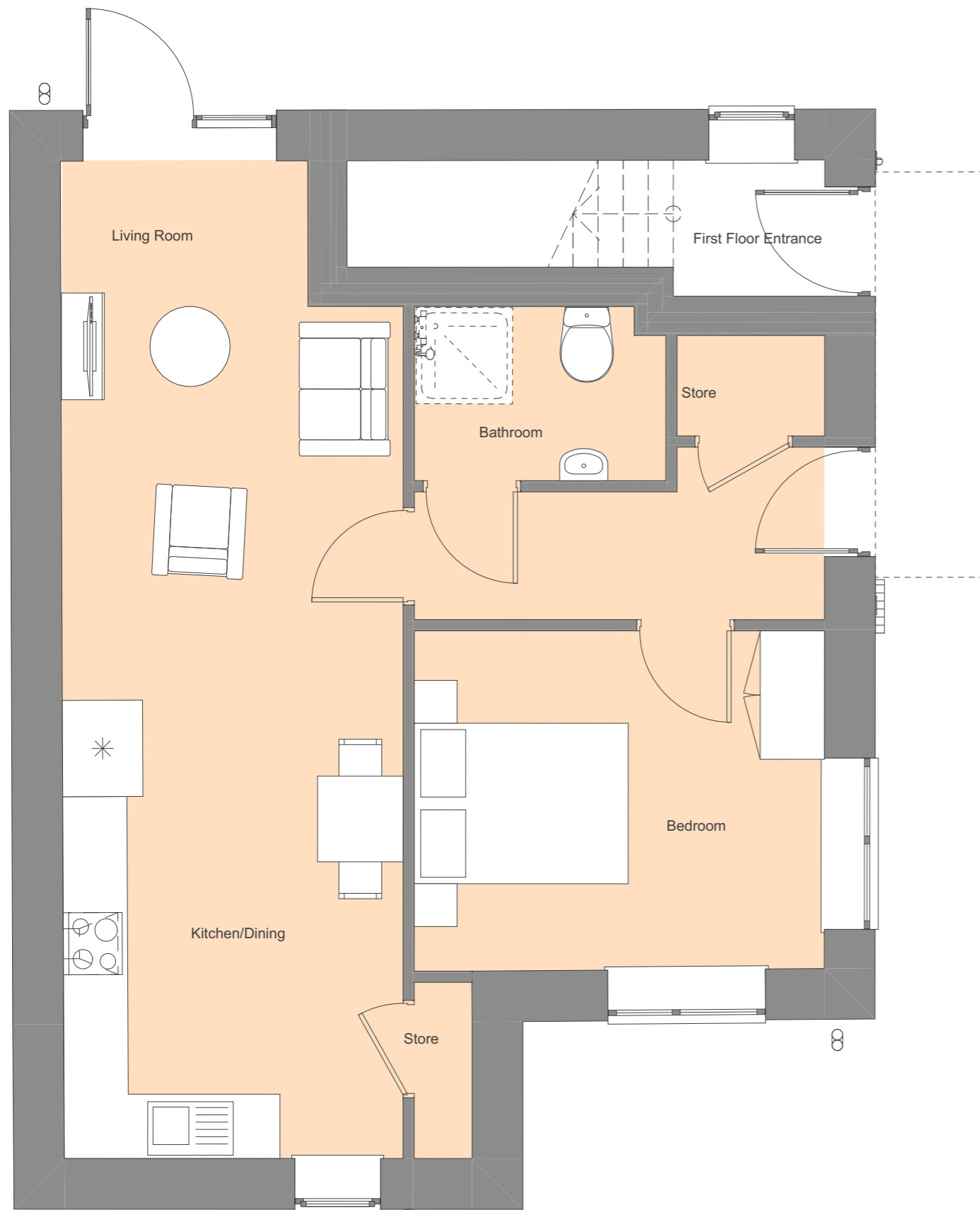
Ground Floor (53.5m2)