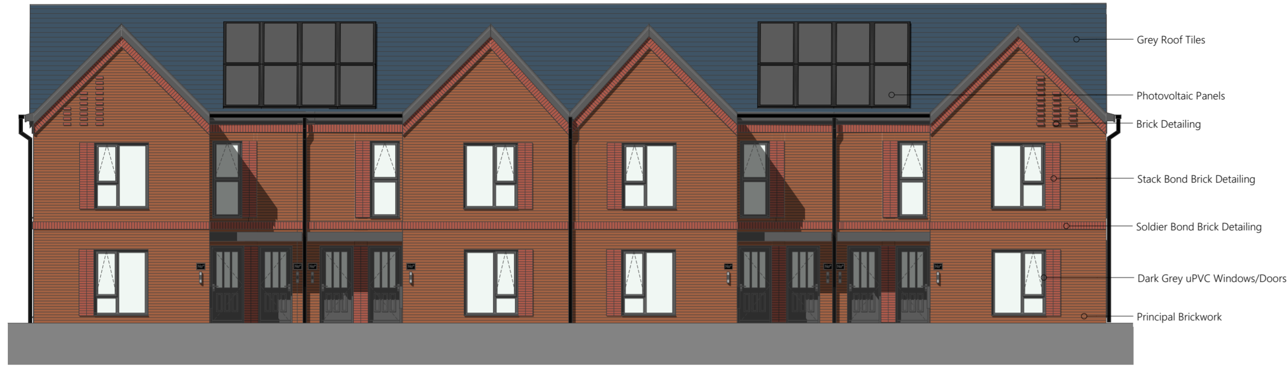
Block 01 Front Elevation 1:100