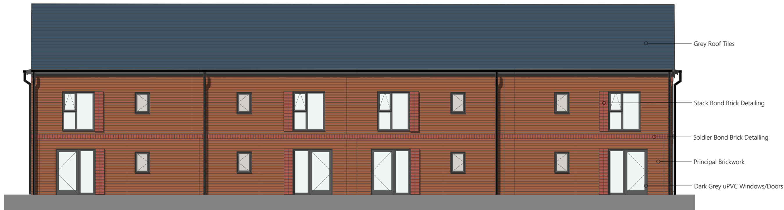
Proposed Back Elevation 1:100