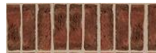
Soldier Bond Brickwork