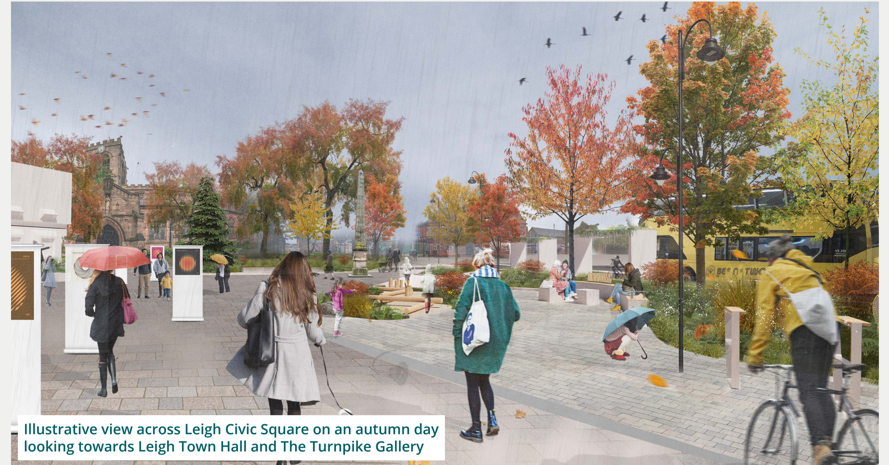
Illustrative view across Leigh Civic Square on an autumn day looking towards Leigh Town Hall and The Turnpike Gallery