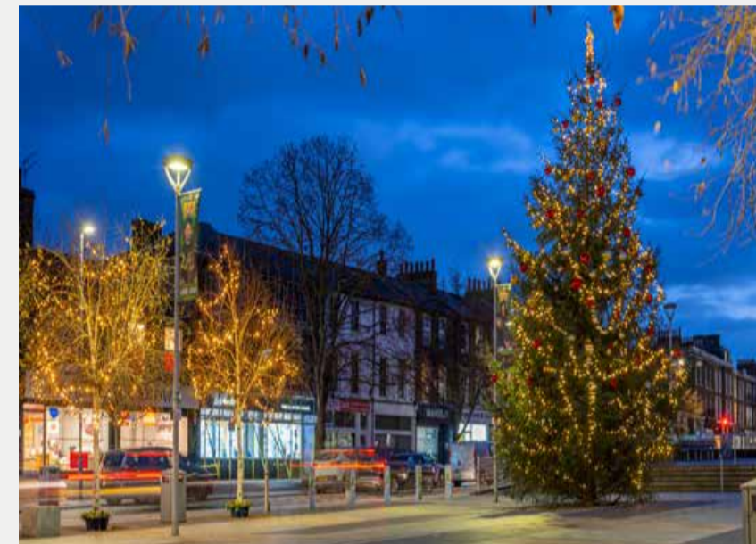
Living Christmas tree