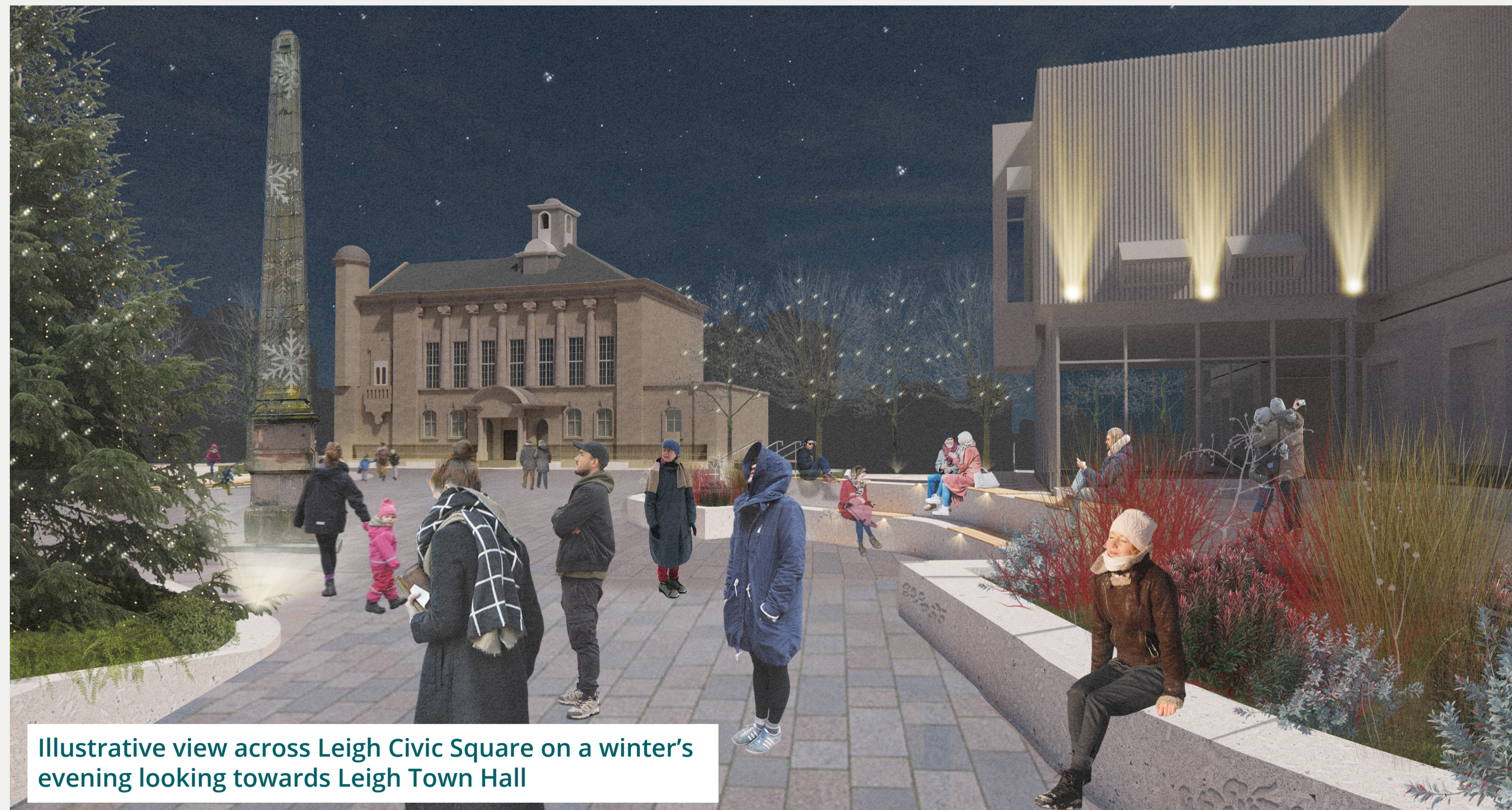
Illustrative view across Leigh Civic Square on a winter's evening looking towards Leigh Town Hall