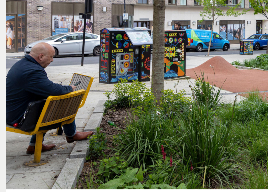
Small group seating

These images show how Leigh Civic Square could look at different times of day or for events.