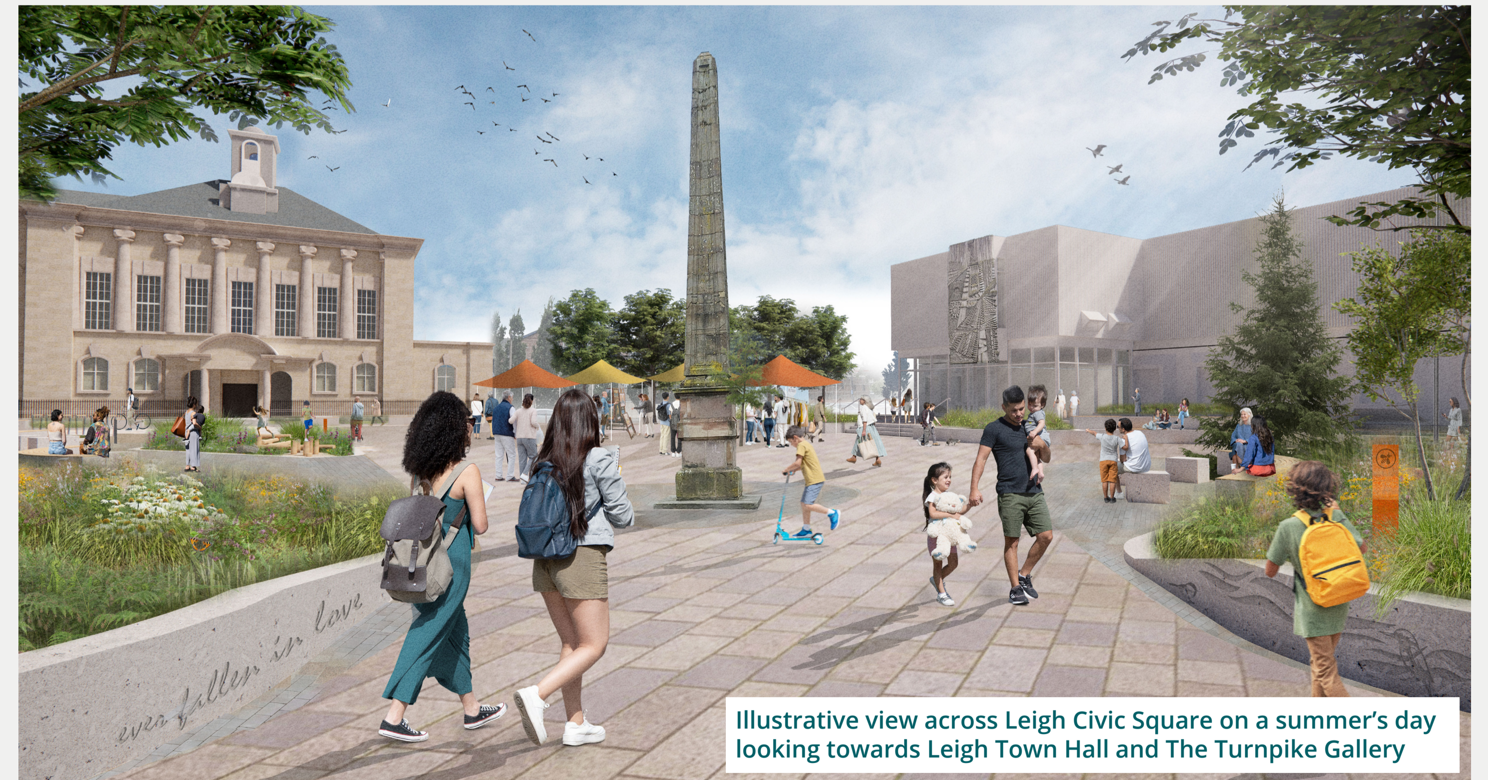
Illustrative view across Leigh Civic Square on a summer's day looking towards Leigh Town Hall and The Turnpike Gallery