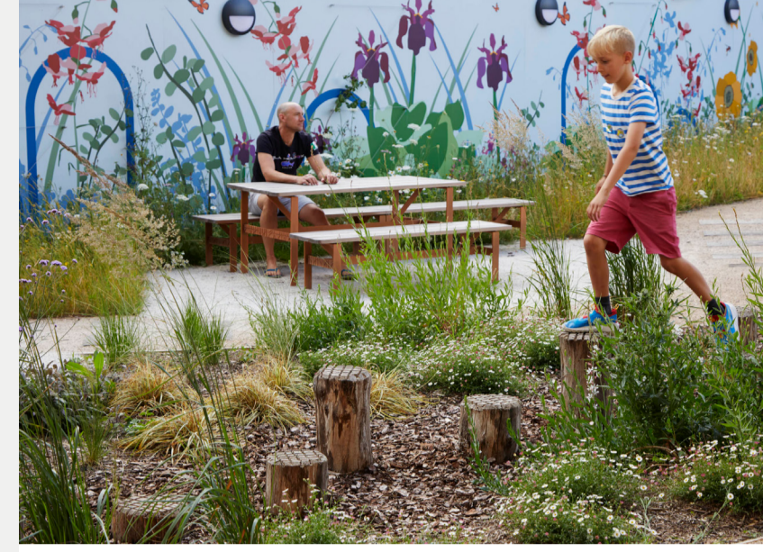
Play and plants (BD Landscape Architects)