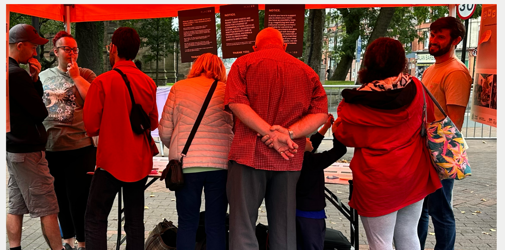
Image of the pop-up stall event