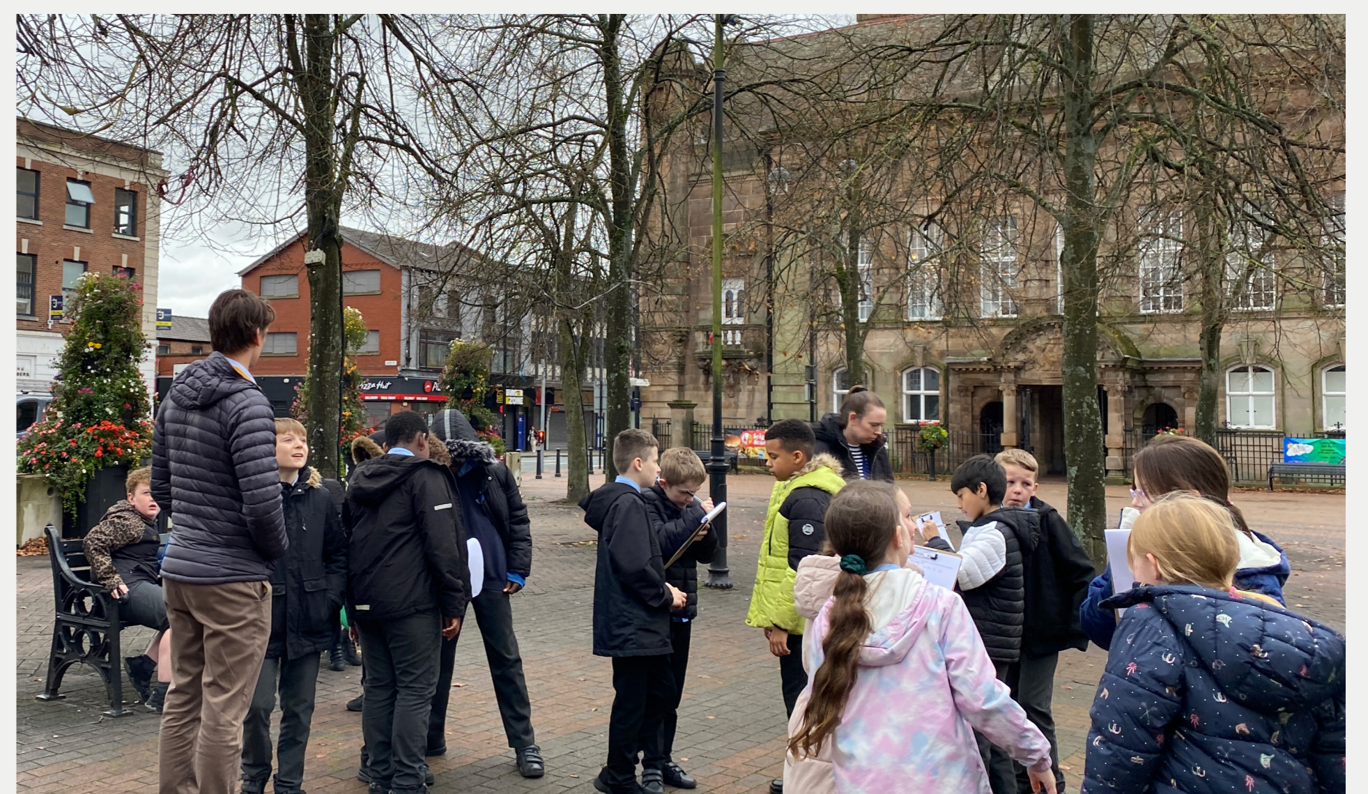
Image of young people visiting the site

All of the local feedback was collected and reported to the designers and Wigan Council who have used that to reflect local views into their design.