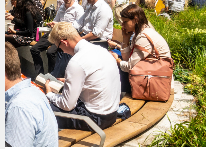
Seating amongst plants