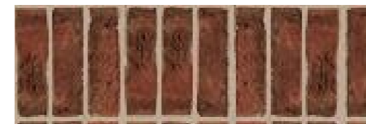
Soldier Bond Brickwork