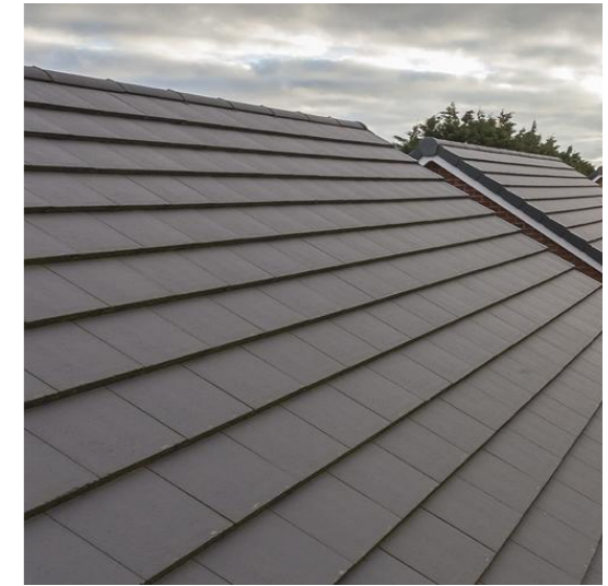
Grey Roof Tiles