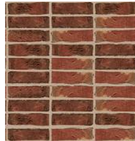
Stack Bond Brickwork