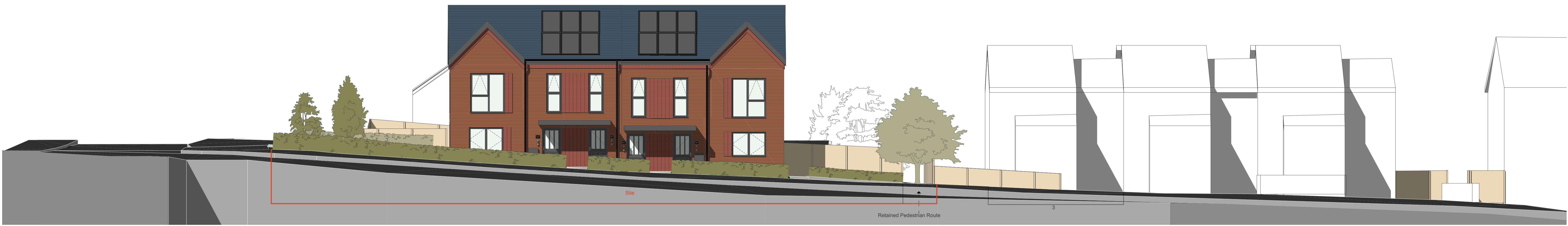
Heysham Road Street Scene