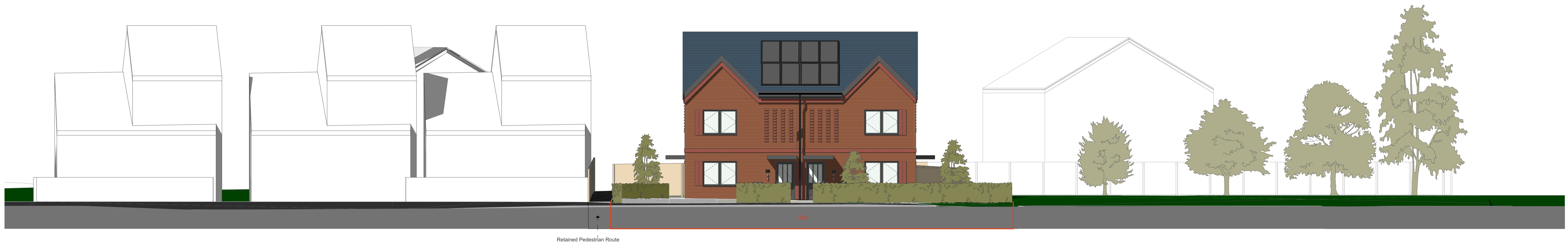
City Road Street Scene