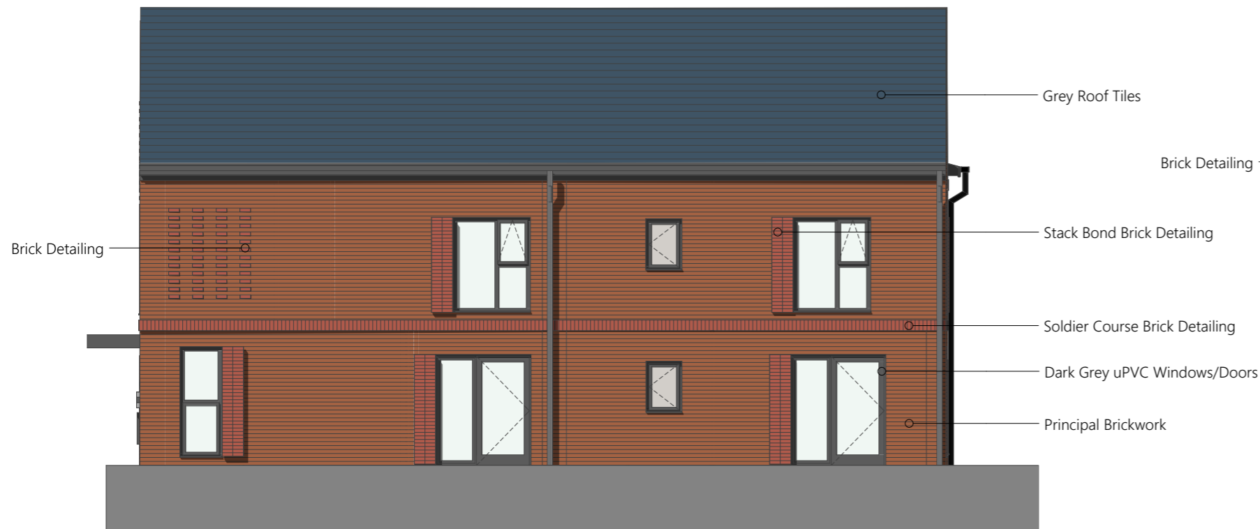
Block 02 Proposed Back Elevation