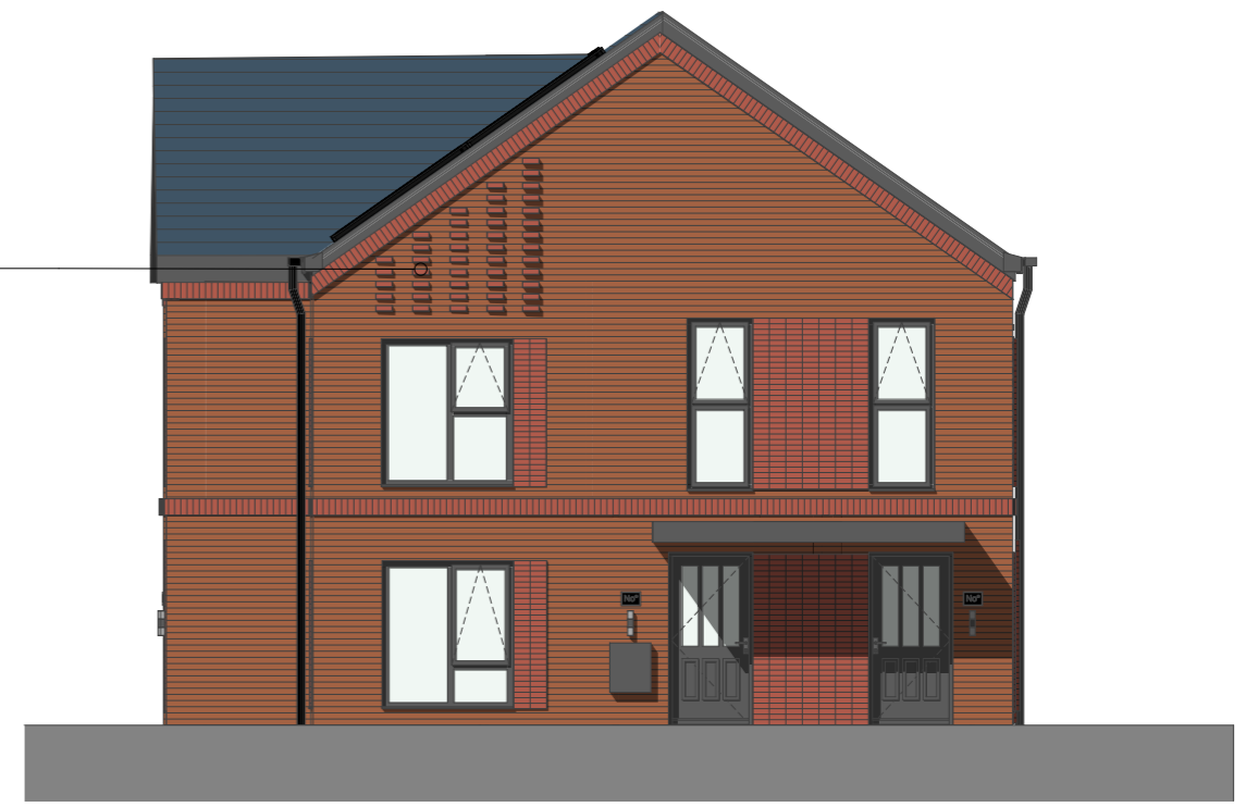
Block 02 Proposed East Elevation