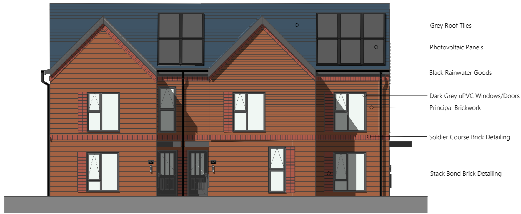
Block 02 Proposed Front Elevation